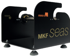
A. Reel Holder