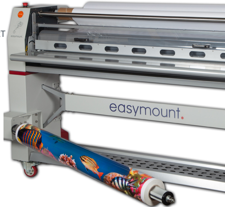
▲ EM-1600SH - with swing-out arm for loading vinyl

Designed in-house by Vivid, the Easymount range gives your business extra capacity by allowing you to offer your customers a complete service that you previously had to outsource.