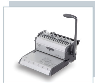
MAGNUM BINDING SYSTEMS