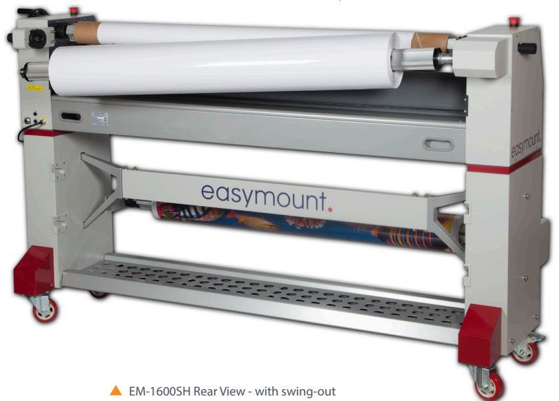
▲ EM-1600SH Rear View - with swing-out arm for loading laminate

The arms makes loading both vinyl and media a whole lot easier and less time-consuming, with no compromise on the finish.