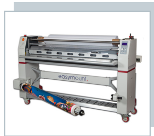
EASYMOUNT WIDE FORMAT SYSTEMS