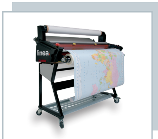
LINEA ENCAPSULATION SYSTEMS