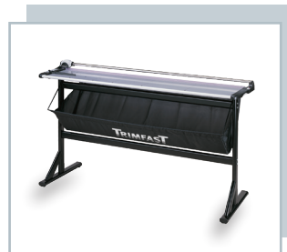
TRIMFAST TRIMMING & CUTTING SYSTEMS