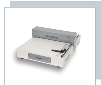
MAGNUM CREASING SYSTEMS