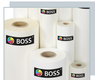
BOSS FILM SUPPLIES

Vivid design and manufacture a wide range of laminating systems, specialising in function, style and reliability.