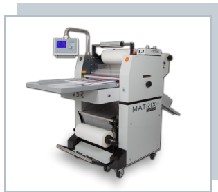
MATRIX DIGITAL FOILING & LAMINATING SYSTEMS

• Yes - No S Special order Non-exhaustive list. Consult us for full stock and availability.