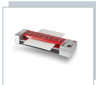
PEAK POUCH LAMINATING SYSTEMS